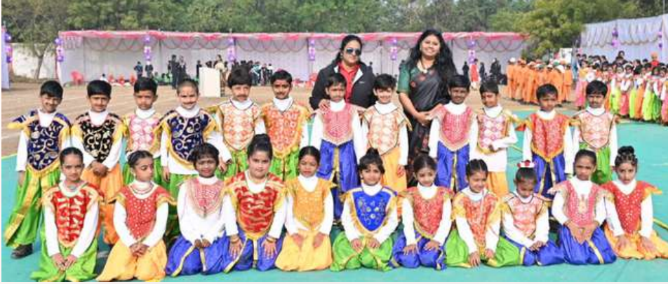
Grade II A