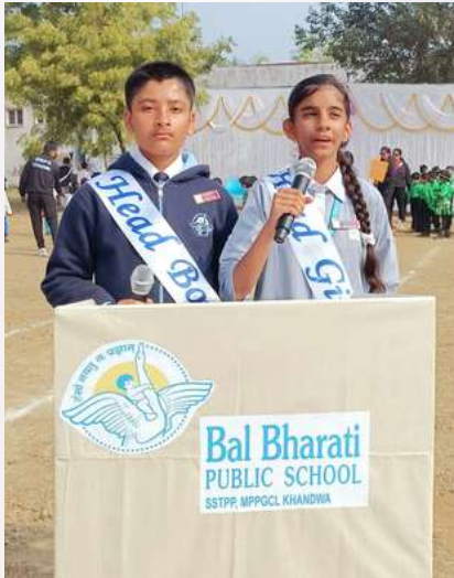
Welcome Address by Head boy & Head girl