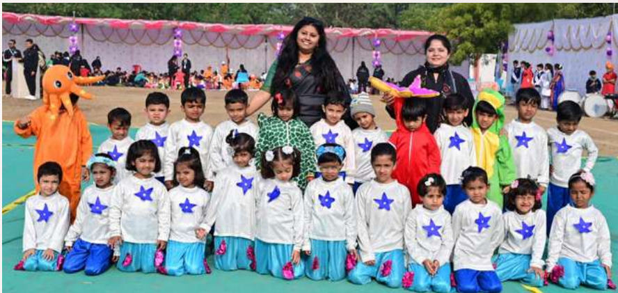
Mont II A