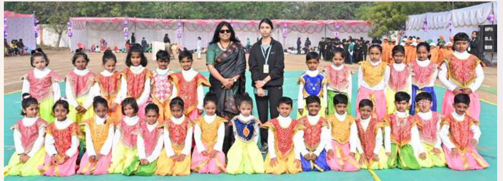
Grade II B