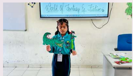
Various puppets used as Teaching Learning Material