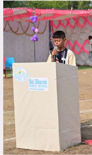
Vote of Thanks by Sports Captain