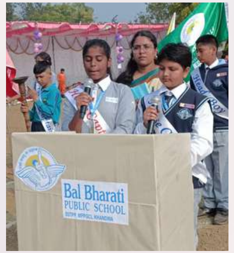
Masters of Ceremony