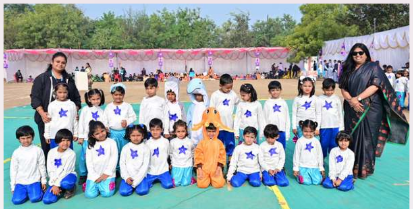
Mont II B