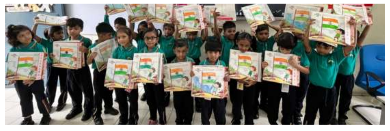
CLASS - III A & III B Colouring Activity