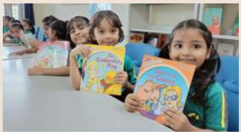
CLASS - I Students immersed themselves in the world of stories during their library session, sharing their thoughts on the tales they read. With every page turned, they honed their reading skills and discovered the joy of storytelling, fostering a lifelong love for books and imagination.