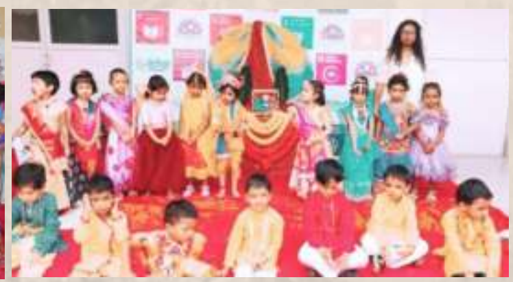
MONT - II