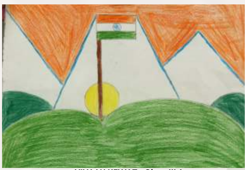
VIVAAN KEWAT - Class III A