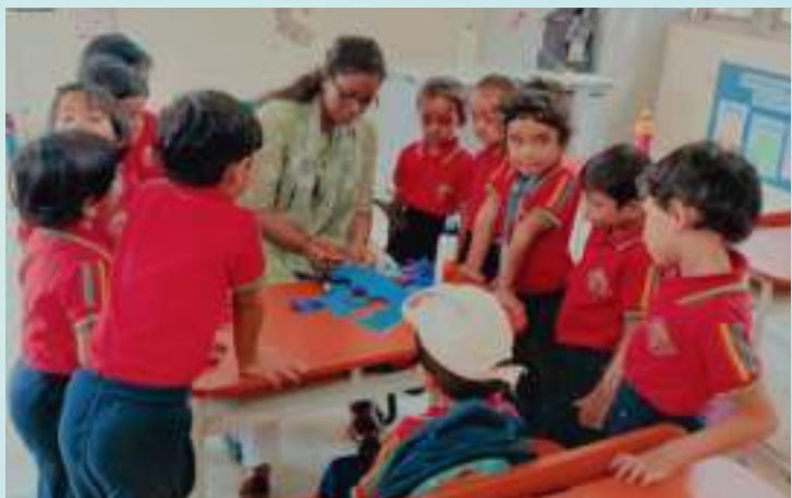
MONT - II