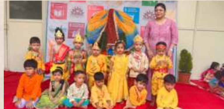
MONT - I