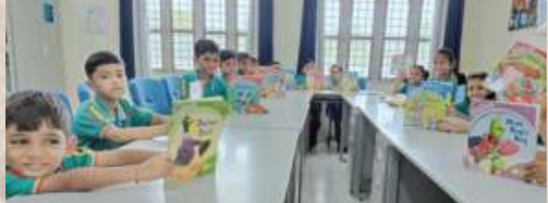
CLASS - III Students showcased their budding analytical skills during an engaging book review session. Expressing their thoughts with confidence, they discussed characters, plots, and themes, demonstrating a deep understanding of the stories they read. The session inspired a love for reading and critical thinking among these young bibliophiles.