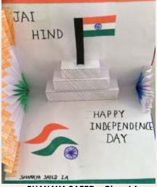
SHANAYA SAEED - Class I A