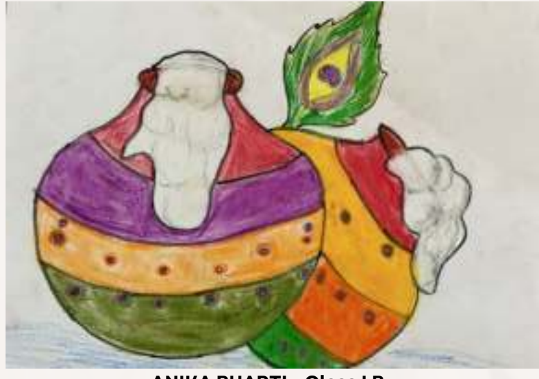
ANIKA BHARTI - Class I B