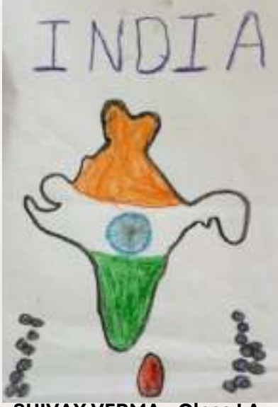
SHIVAY VERMA - Class I A