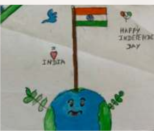
SHRUTI DANDGE - Class I B